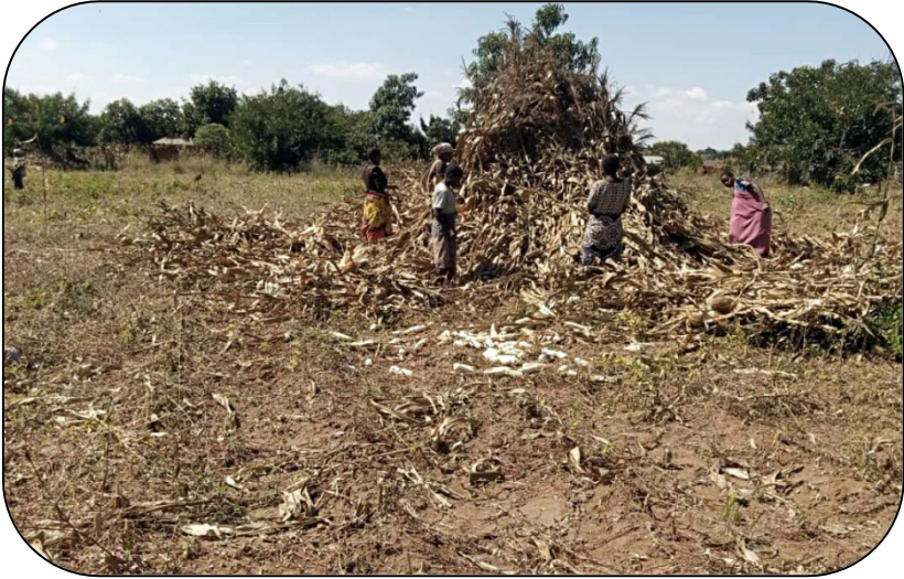
Above: Maize stock tower ready for harvesting